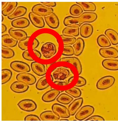
染色之白血球 (嗜異性球, Heterophil)