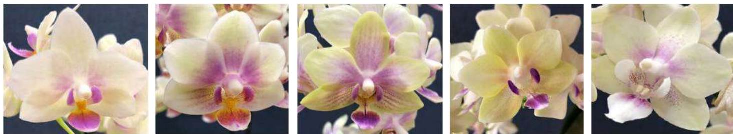
TYP0944 #01 (Y48) TYP0944 #03 (Y50) TYP0944 #05 (Y51) TYP0944 #06 (Y52) TYP0944 #07 (Y53)