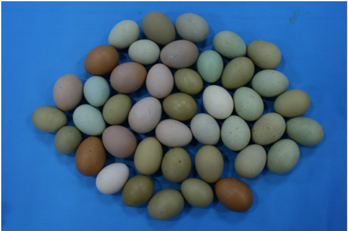
Figure 1 Chicken eggs show the variety of colors. (Liu, 2010)

There is still no evidence to show connection between eggshell color and egg quality. It is often a cultural preference for one color over another. The reasoning which prompts the customer to select a large, white egg or a smaller, heavily pigmented egg is quite different. The large egg represents value for money. The brown egg, on the other hand, will always manage to evoke Pavlovian images of farmyards and free-range feeding (Solomon, 1991). For example, in most regions of the United States, eggs are generally white. While consumers in some markets throughout the world prefer brown eggs over white eggs (United Kingdom, Italy, Portugal, Ireland, Southern Asia, Australia, and New Zealand) (Odabaşı et al. , 2007).