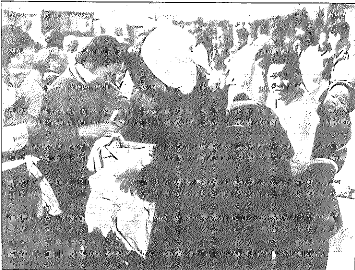
NEW CLOTHING: gift of private U. S. citizens.